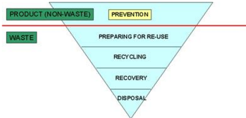
Figure 1. The hierarchy of waste management

In Europe, the framework Directive 2008/98/EC in the field of waste sets the basic concepts and definitions related to waste management, the waste legislation and policy of the EU Member States that shall apply as a priority order the following waste management hierarchy represented in figure 1.